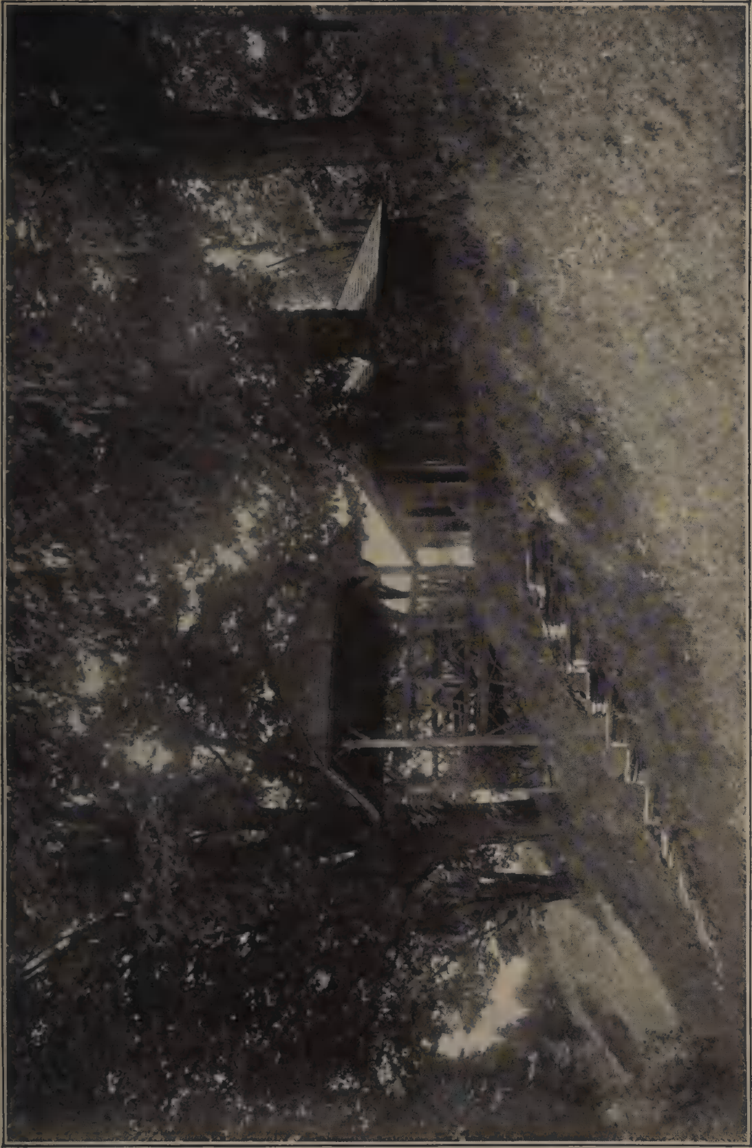
THE STUDY, RIVERBY